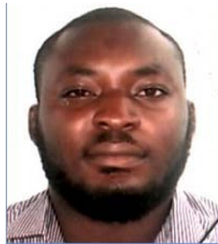
Photograph taken in 2014