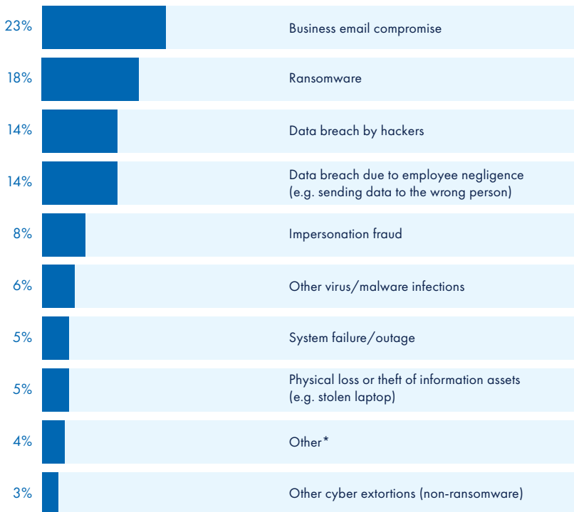
Fig 1 Cyber Claims received by AIG EMEA (2018) – By reported incident

*Denial of Service Attacks, Legal/Regulatory Proceedings based on violations of data privacy regulations