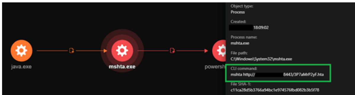
Figure 3. Remotely executing an HTA file from the C&C server. Screenshots taken from Trend Micro Vison One.

The ADSS JAVA component (C:\ManageEngine\ADSelfService Plus\jre\bin\java.exe) executed mshta.exe to remotely run a remotely-hosted HTML application (HTA) file from the attackers' command and control (C&C) server. Using Trend Micro™ Vison One™, we mapped out the processes that the infection performed to spawn the process.